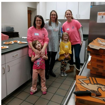
In January, members of the Fuquay-Varina Junior Woman's Club volunteered to help serve at Read and Feed at Lincoln Heights Elementary.