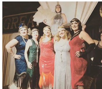
The Hickory Juniors kicked off their New Year with a party by TwoSuits at Market On Main .