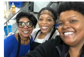
Some of the members of Burlington Junior Women's Club joyfully serving at Joe's Diner at Allied Churches.