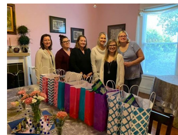
At Clayton Junior Women's Club annual planning retreat, they assembled bags of toys for the children at Harbor House.