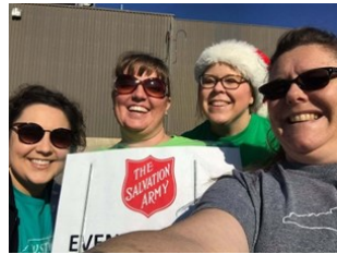
Winston Salem Junior Women's Club having fun serving their community together.

Social media is such a wonderful tool to promote your club events and meetings. Are you using it to call attention to all of the exciting events held by your club? Are you posting meeting dates and activities that your members are involved in? Look at what our GFWC-NC Juniors are posting!